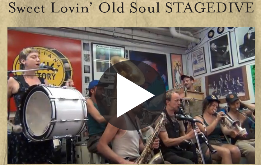
Freight Train Blues