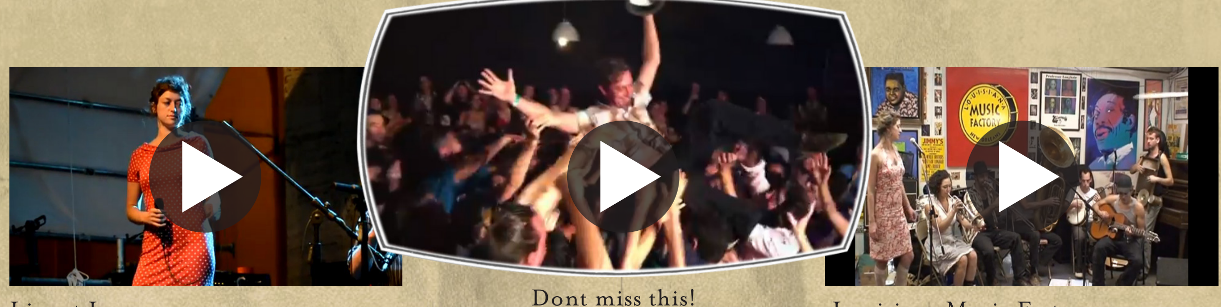
Live at Lugano