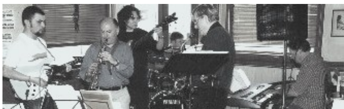
The First Gig Orange Bar Ashford

CDs Their first CD Dig a Little Deeper (2002) reached No2 in MP3.com jazz charts CD Review: New Smooth Indie-Jazz From Groovechasers From across the pond comes the inde- pendent U.K. jazz band the Groove- chasers with their latest album "Back On The Right Track." Having been