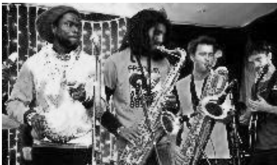
C C in action at one of their concerts

CC Les Freres Smith are a 12 piece Afrobeat band from Paris who are coming to the UK for a 3 date tour in October 23-25. See What Where When